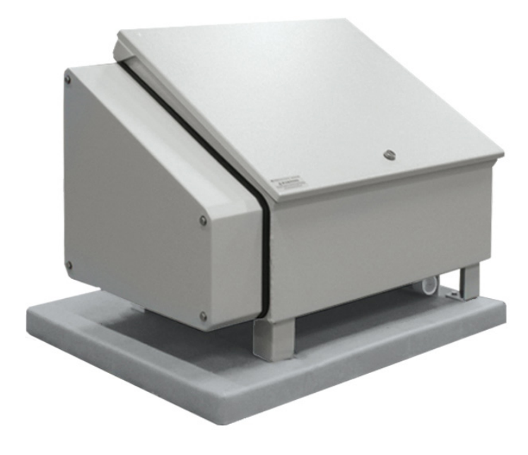
Options: Sound kits, Shallow Water AirStations and VBS remote valve boxes

Vertex diffused aeration systems are super-efficient, affordable and safe. The rising force of millions of bubbles transports bottom water to the surface, allowing oxygen to be absorbed and circulating the entire water column.