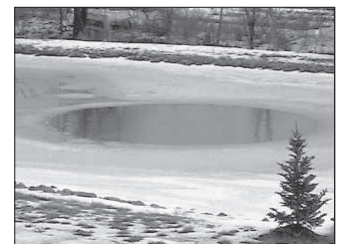
Open water and thin ice caused by aeration

If you choose to turn off the system for the winter: